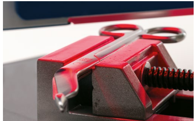
Verification of surgical instruments

Optimize the print quality of your codes by utilizing detailed measurement results.